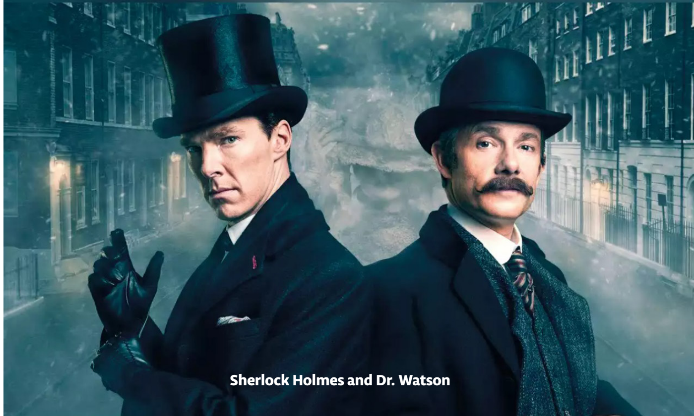
Sherlock Holmes and Dr. Watson

'I did not', replied Holmes, 'but unless he did, or for that matter the singleton king, then the contract could not be made.'